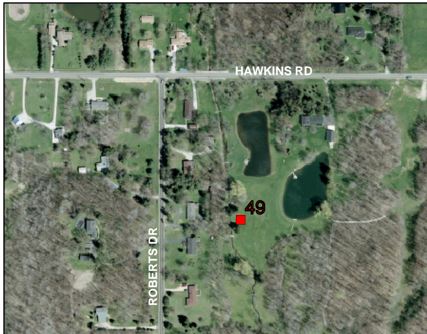
Priority Area 49