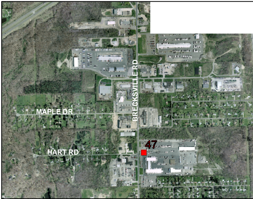
Priority Area 47