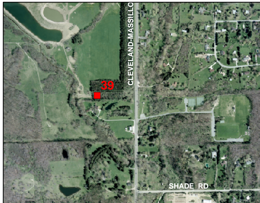
Priority Area 39