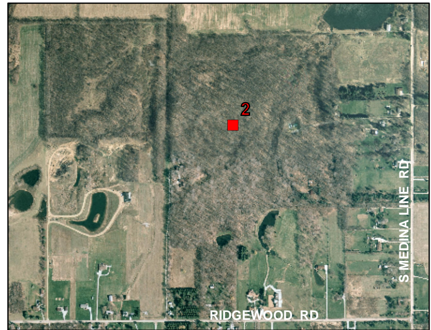
Priority Area 2