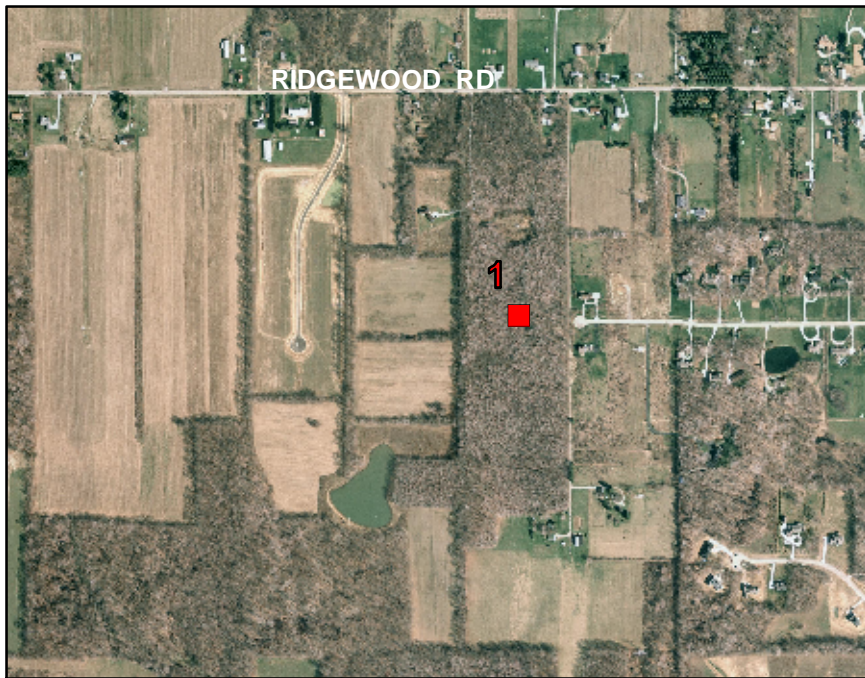
Priority Area 1