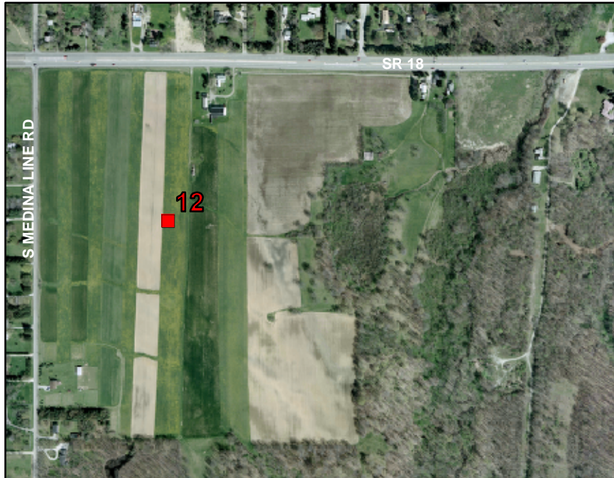
Priority Area 12