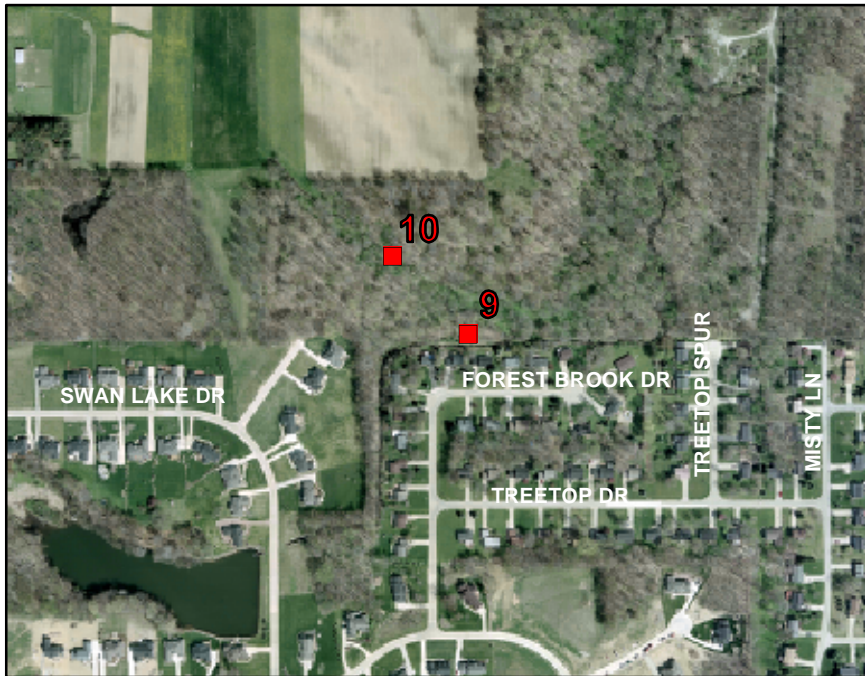
Priority Areas 9 and 10